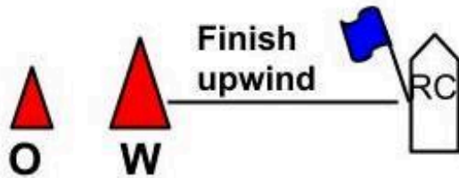
J/105, J/88 and Melges 24 classes